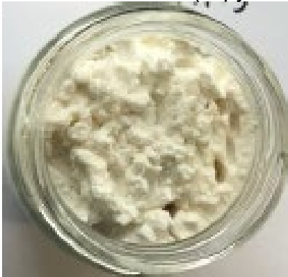
Figure 2: Visual appearance after recovery from low temperatures (-10 °C, 16hours, then room temperature for 8 hours)